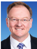
The Hon Roger Jaensch MP

Minister for Human Services, Minister for Housing, Minister for Planning